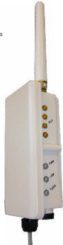
IP67-RATED POE OUTDOOR UNIT

adaptiveRF Ltd is the designer and manufacturer of the IPM2 product range and dependent on volume requirements can offer customer specific frequency, bandwidth and RF output power variants.